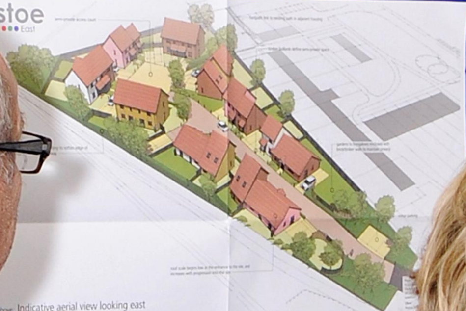
above Indicative aerial view looking east