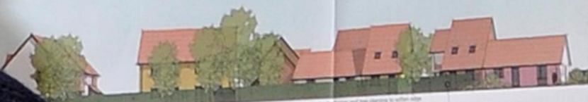
below Indicative view of development across fields, looking east