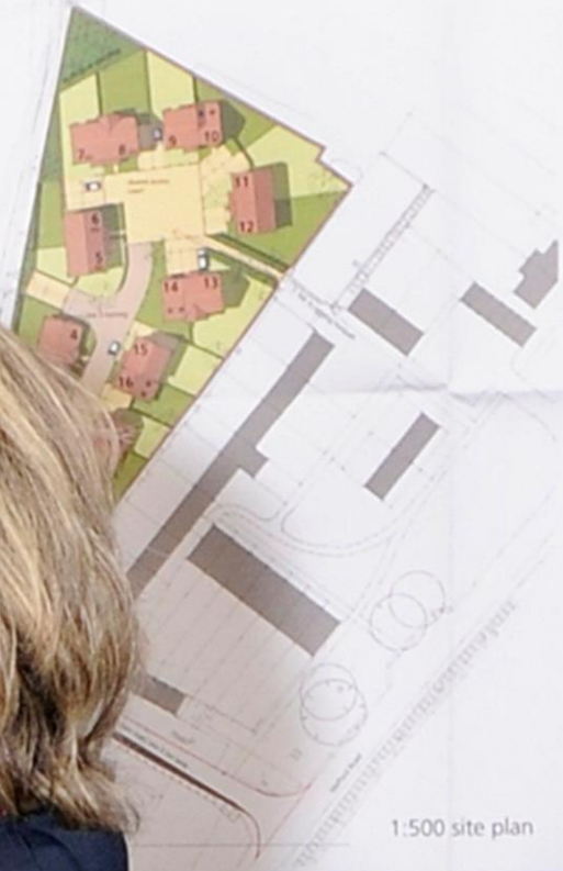
1:500 site plan